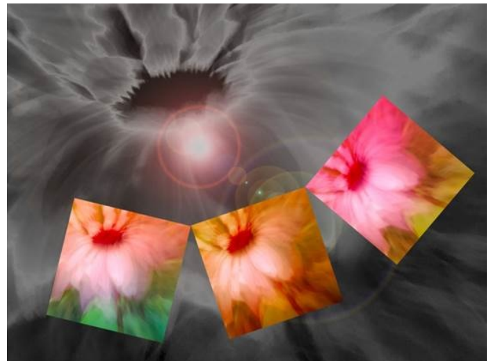
Intermediate Gold A Condition of Colour Theresa Bryson